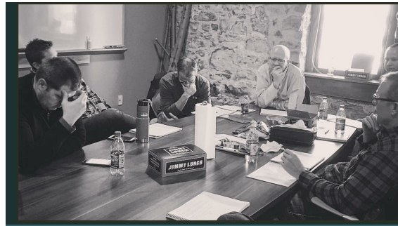
Mick's A Way of Life marketplace group

How does your craft provide you a platform to serve those within your workplace?