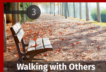
Walking with Others