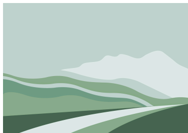
AN EXAMINED LIFE