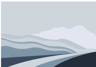
AN ATTENTIVE LIFE

All four of these ingredients are embedded in The Journey , an uncommon, faith-deepening, community-building, and life-aligning process.